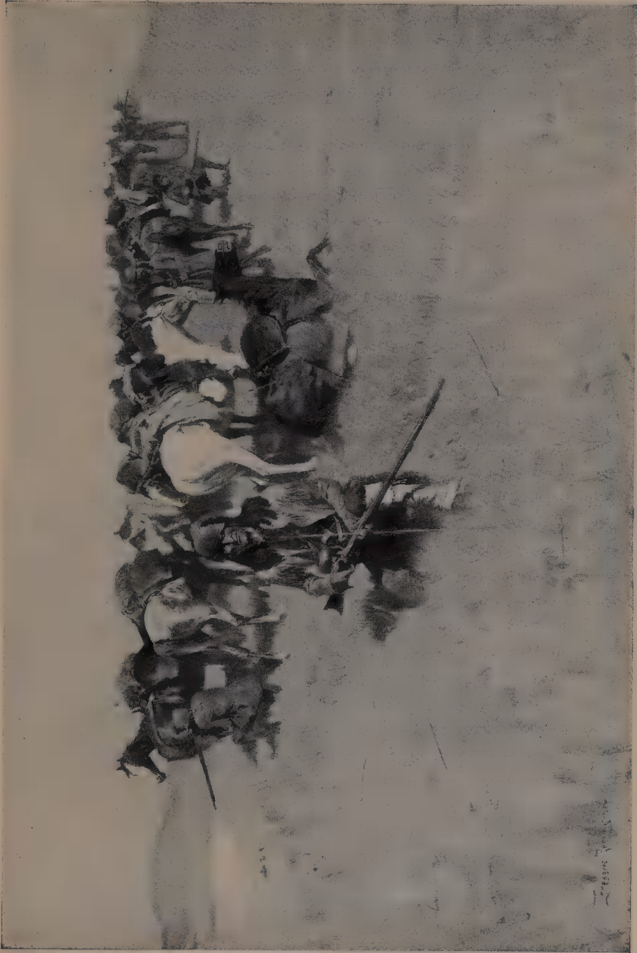
Drawn by Frederic Remington.